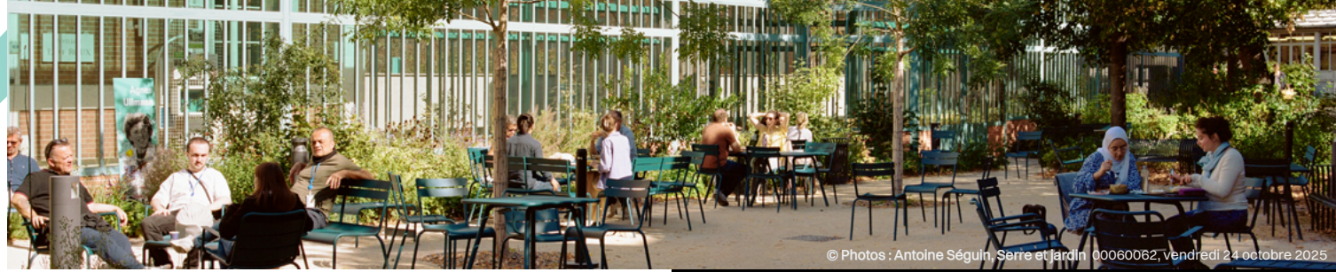
Serre et Jardin 00060062, vendredi 24 octobre 2025

A three-year PhD program for French and International health professionals (MDs, PharmDs, VetDs) and medical students seeking to enhance their curriculum with a PhD.