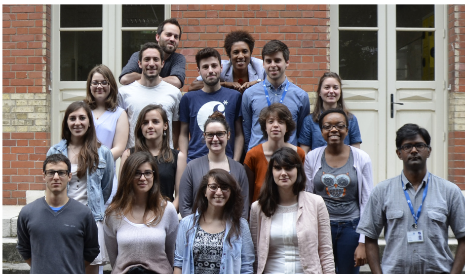
The iGEM Pasteur Paris 2016 Team (partial group shown above) will compete with Mos(kit)o project, for the detection of arboviruses. Read the story on page 6.

could soon be recorded in the Network. Another enticing perspective for international education, the PanAfrican Coalition for Training in Research and Public Health (PACT) is anchored by the 10 institutes of the Network in Africa. Based on local needs, it will provide education tracks through research, in partnership with local universities. Finally, education and training are