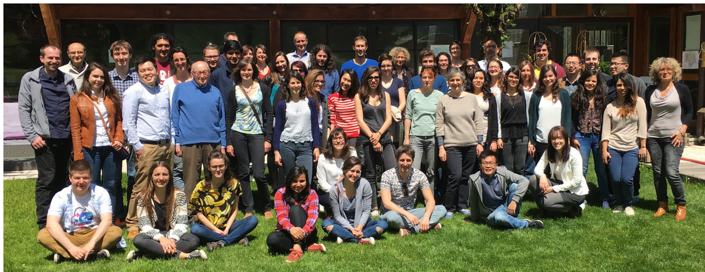
7th Annual Retreat of the PPU program, Morzine, May 18-20, 2016.

The PPU program has always strived to extend the benefits that PPU students enjoy to all students on campus as much as possible. The PPU steering committee is reflecting upon how to implement the latest changes and is considering