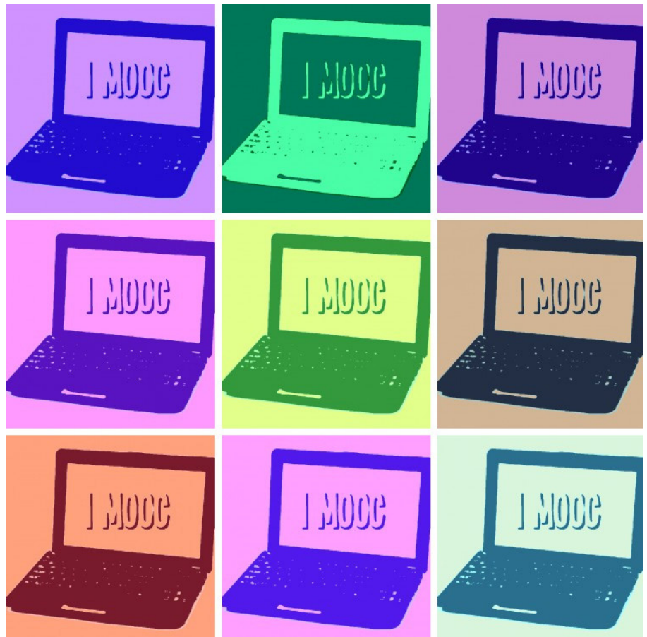
Illustration "1 MOOC"