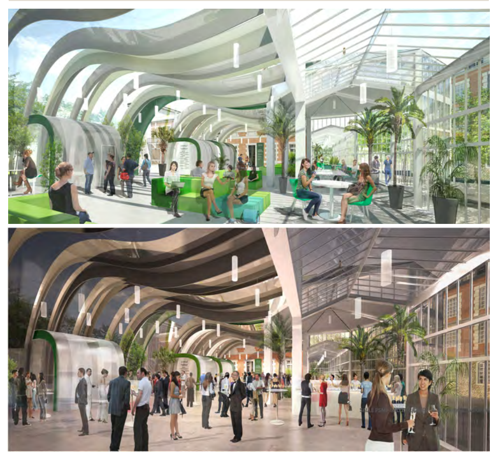
The Education Center renovation project strides forward. An architectural rendering of the expanded greenhouse interior planned for the Education Center. See story on <u>page 10</u>.

PRESENTING THE TUTORING PROGAM MISSION P2 NOBEL-PRIZE WINNER BARRE-SINOUSSI TO SPEAK AT 3RD GRADUATION CEREMONY P3 PROFILE: EDUCATION CENTER TEAM & ACTIVITIES P4 TRAINING FUTURE GLOBAL HEALTH SCIENTISTS P5 INSIDE THE CENTER FOR RESEARCH AND INTERDISCIPLINARITY (CRI) P6 THE INTERNATIONAL TRAINING PROGRAM P8 UPDATE ON EDUCATION CENTER RENOVATION P10 LETTERS P11 CALENDAR P11 COURSES AND WORKSHOPS P12 ANNOUNCEMENTS P13