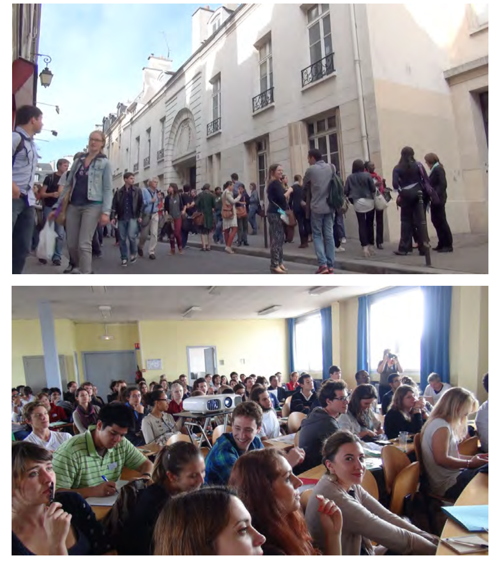
The innovative campus of CRI Paris is in the Marais. The CRI fosters students' initiative and freedom to learn, teach and do research.